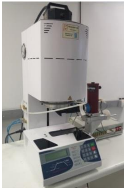
Figure 2. Diffusivimeter QuadruFlash 1200.

This diffusivimeter, manufactured in Brazil, is constituted by a xenon lamp (1200 J), responsible for the energy pulse, three K-type thermocouples of special class, an InSb infrared detector, an oven for heating the sample and a signal processing unit. A short thermal excitation is generated by the xenon lamp. The flash is directed inside a resistive furnace, allowing heating of the tested specimen from room temperature to 1200 °C and the temperature rise of the specimen is measured by three K-type thermocouples.