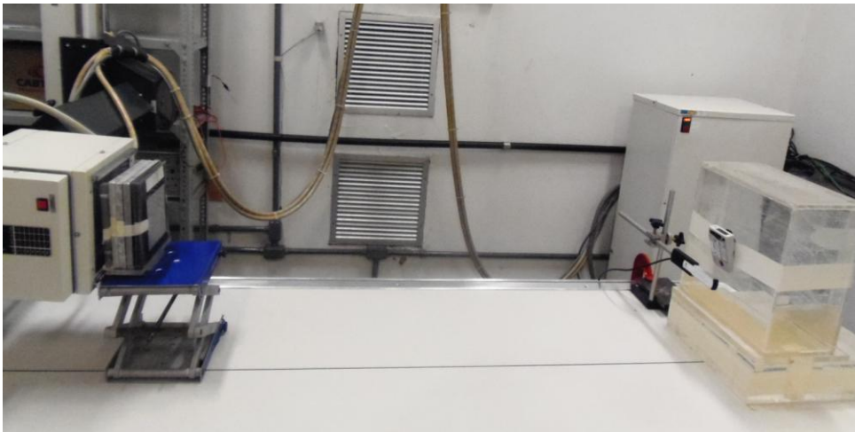
Figure 2 - Irradiation set-up for testing the electronic personal dosimeters in pulsed X-rays of a medical machine.

Dosimeters were also tested in pulsed x-ray beams of the VMI medical machine on the ISO slab phantom. The Xi light UNFORS dosimeter was positioned on the surface of the slab phantom almost out of the radiation field to monitor the exposure (Figure 2).