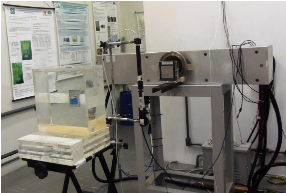
Figure 1- Irradiation set-up for testing the electronic personal dosimeters in a constant potential x-ray machine.

The dosimeters RAD-60 RADOS, PDM-111 ALOKA and EPD-MK2 THERMOELECTRON were calibrated in ^{137}\text{Cs} beam and then tested according to their operation ranges in x-rays, in terms of the personal dose equivalent, \text{Hp}(10) . The true conventional value of \text{Hp}(10) was determined based on the air kerma value free in air and conversion coefficients to \text{Hp}(10) . Each EPD was positioned on the ISO standard slab phantom in the continuous x-ray beams of the Seifert Pantak machine (Figure 1).